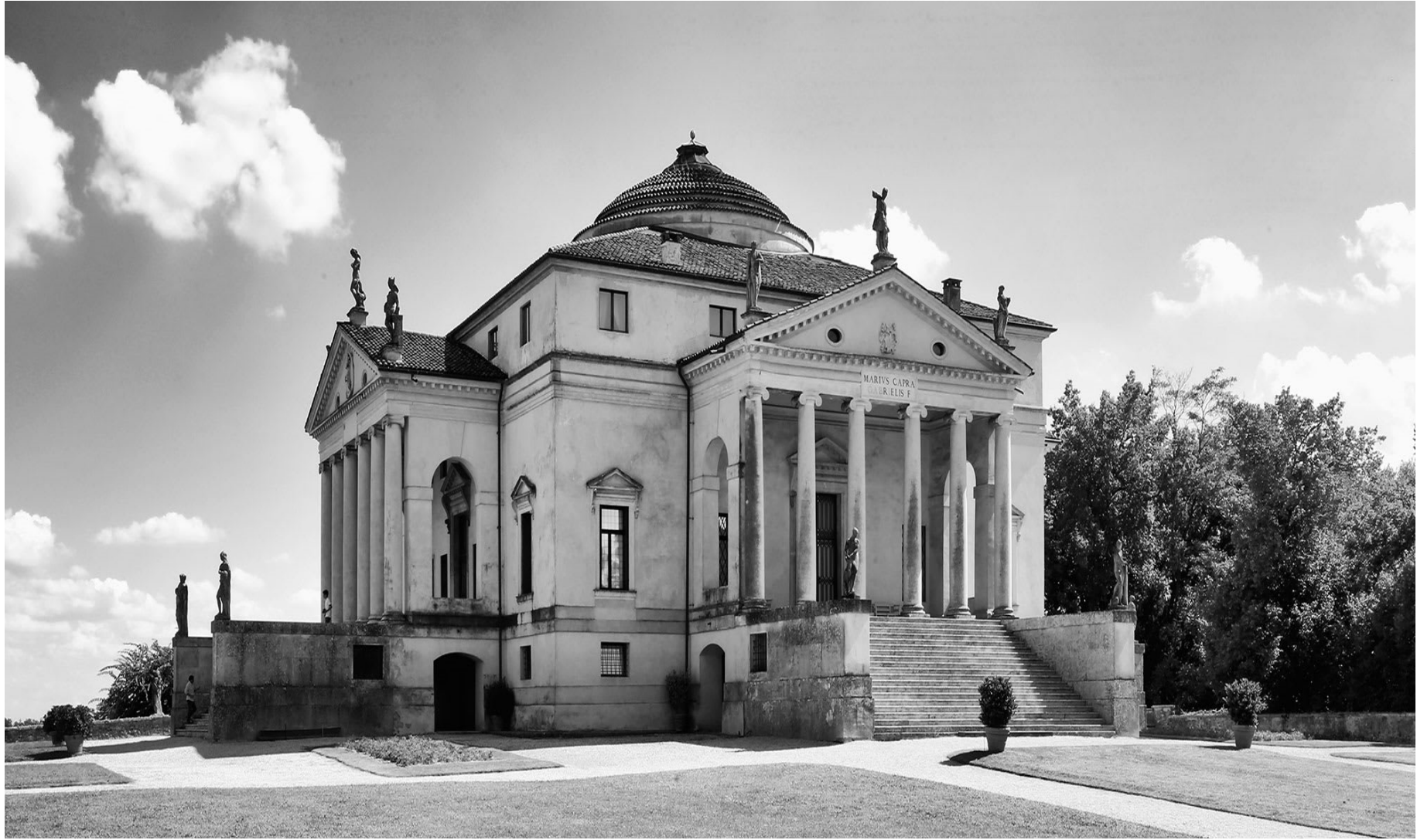
Villa Rotonda, near Venice, Italy