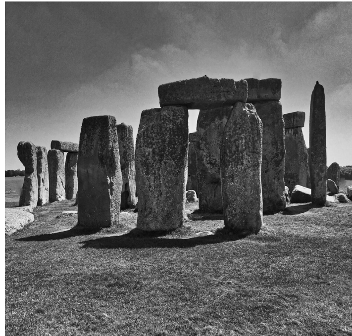
Stonehenge in Amesbury, United Kingdom