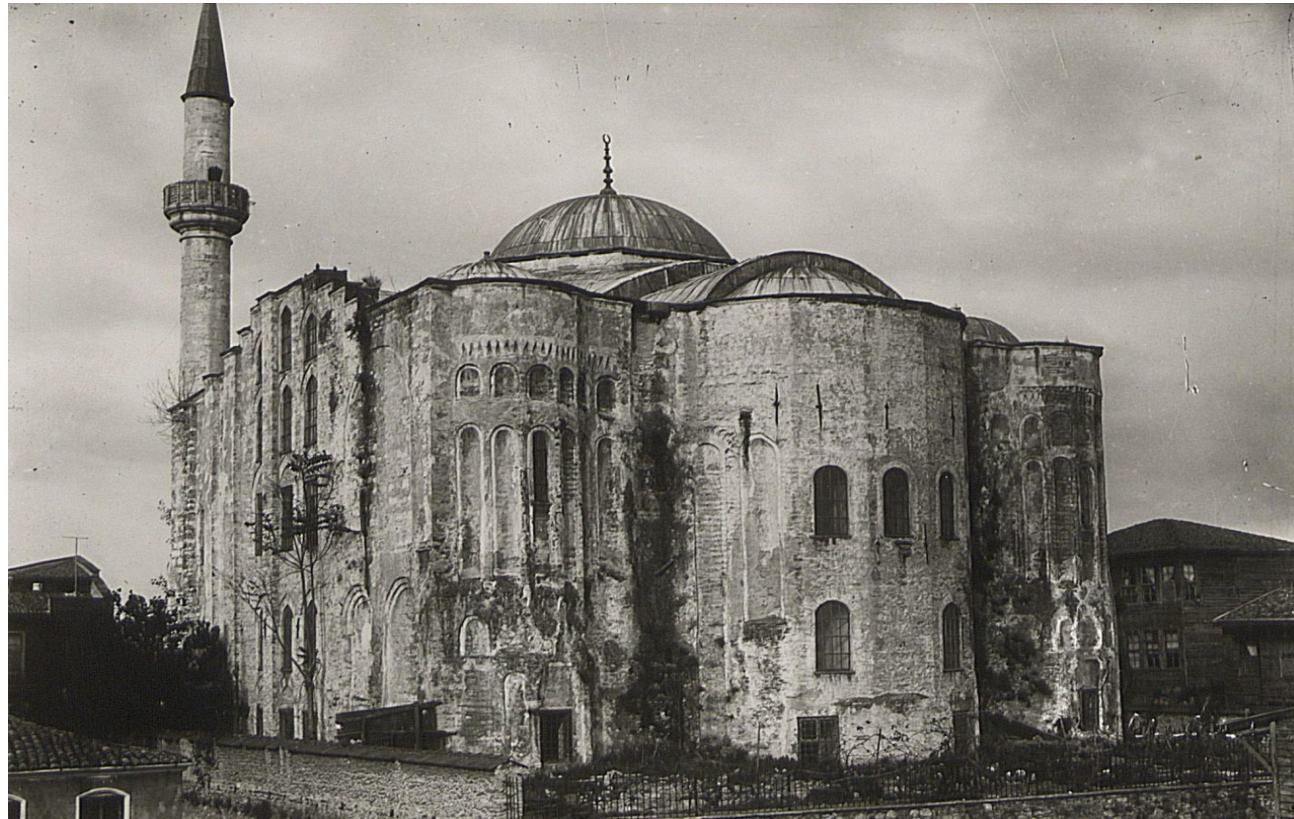
Church of Hagia Eirene Istanbul, Turkey