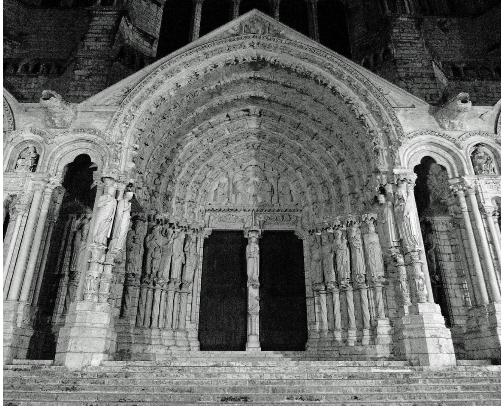
Notre Dame de Chartres, France