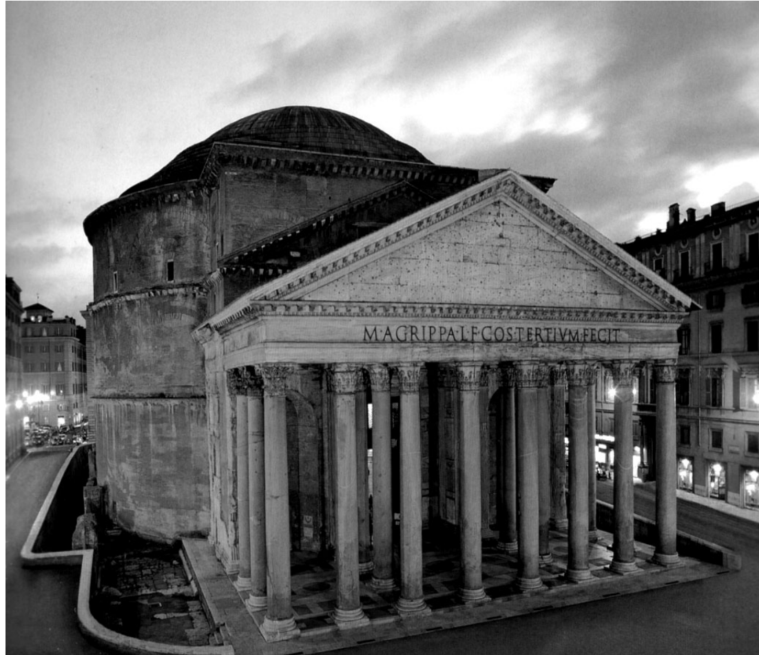
The Pantheon, A.D. 126, Rome, Italy.