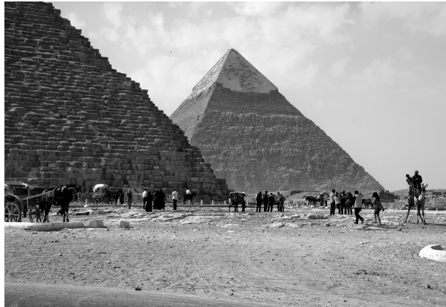
The Pyramid of Khafre in Giza, Egypt.