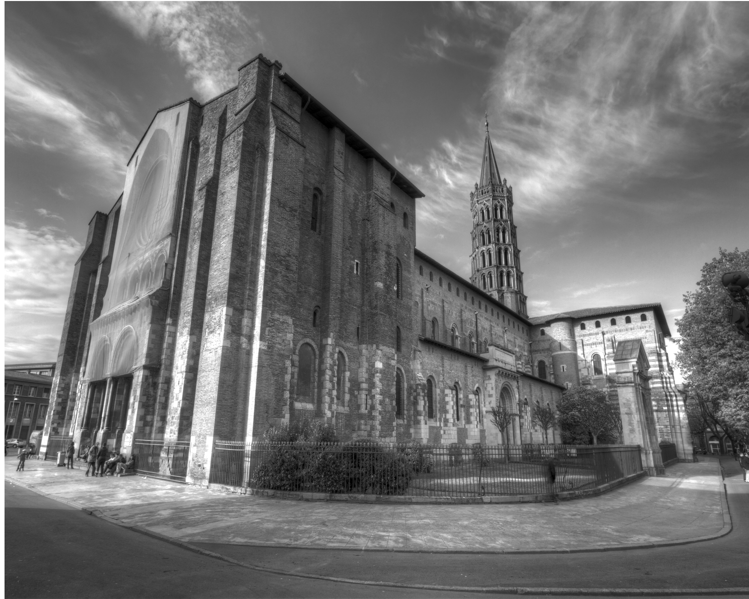
Basilica of St. Sernin in Toulouse, France