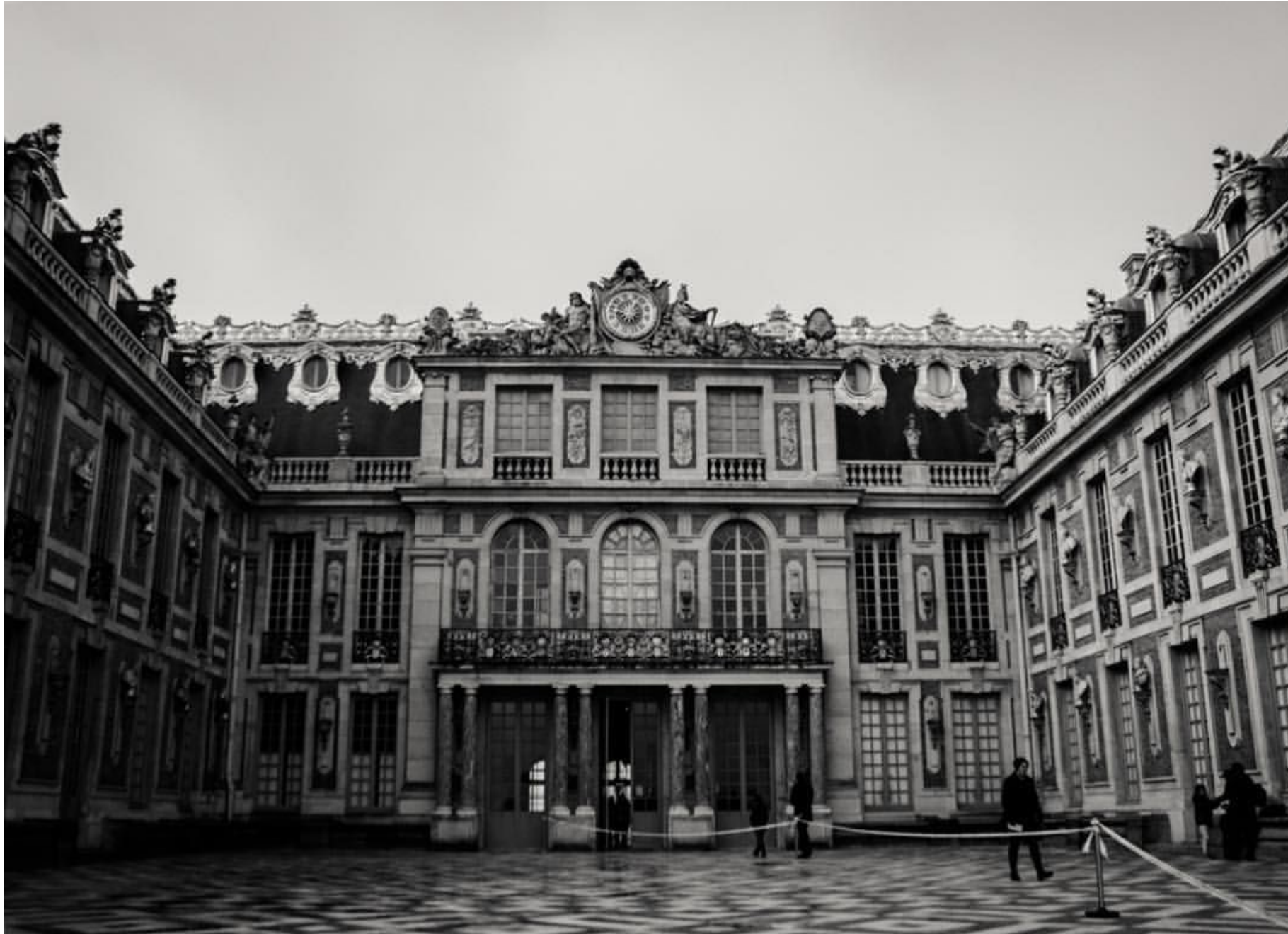
Palace of Versailles, France